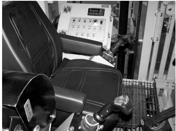
Spacious operator's cab

Visit our web site: www.racinerailroad.com