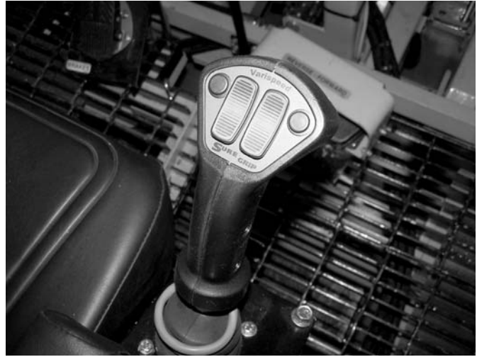
Multi-function joystick control