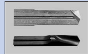
HSS flat-beaded bit, top. Cobalt straight-shank twist drill bit, bottom.

The Racine Ultra Drill is a compact, lightweight gasoline-powered rail drill.