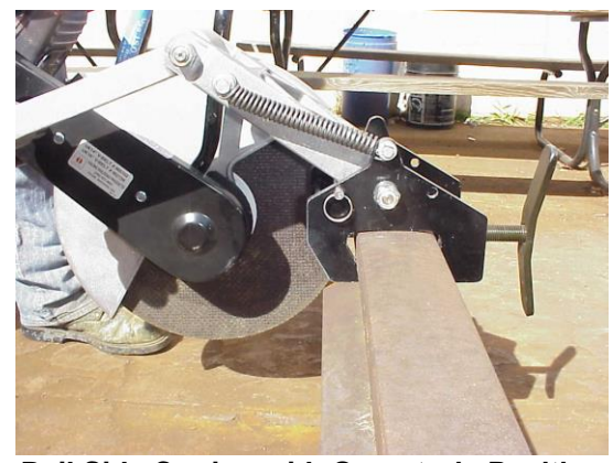
Rail Side Cutting with Operator's Position Opposite of Clamp Tensioning Screw Stop Pin is inserted on operator's side.

Phone: (262) 637-9681 Email: <u>custserv@racinerailroad.com</u>