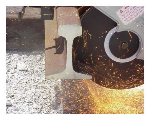
Side Close Up View