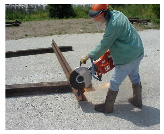
Top Rail Cutting