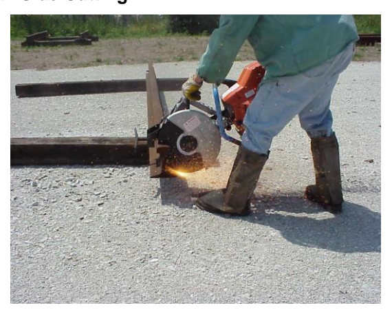
Rail Side Cutting View