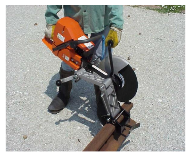
Cutting Position Outside View Pivot shaft and thread engaging tightening crank.