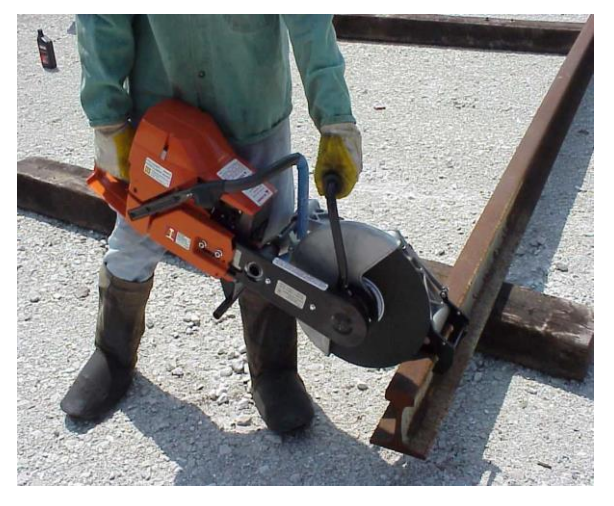
Cutting Position Inside View

Phone: (262) 637-9681 Email: <u>custserv@racinerailroad.com</u>