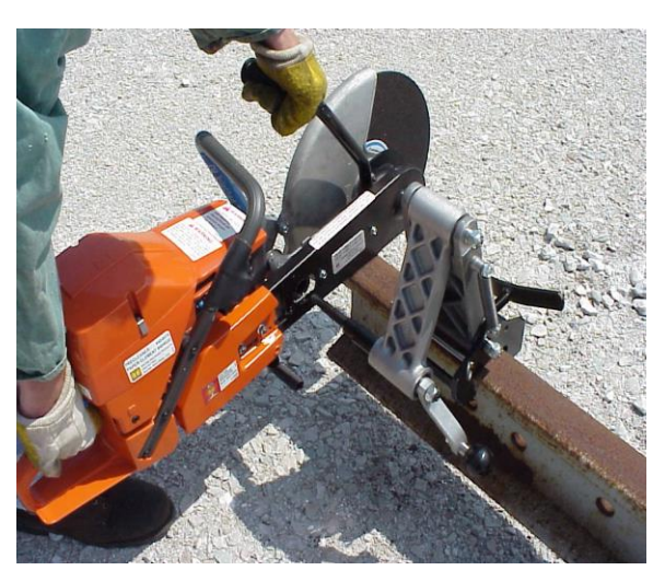
Mounting the Ultra Kut II Saw Rail clamp shaft shown being inserted into mounting receptacle.