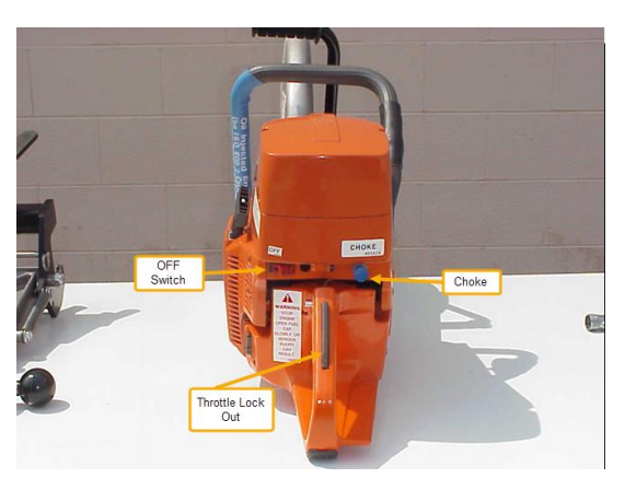
Ultra Kut II Saw Controls