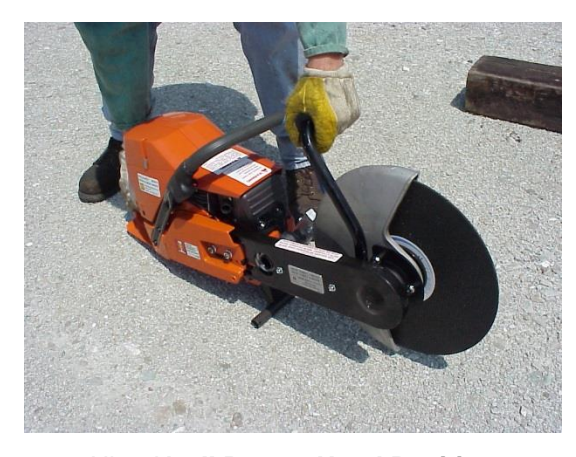
Ultra Kut II Proper Hand Position