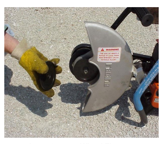
Inner & Outer Wheel Flanges