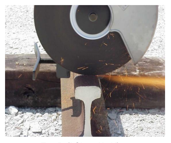
Top Rail Close Up View