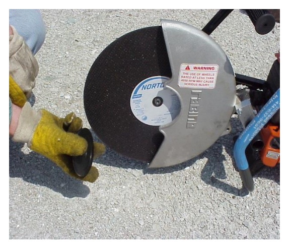
Wheel with Blotters

Phone: (262) 637-9681 Email: custserv@racinerailroad.com