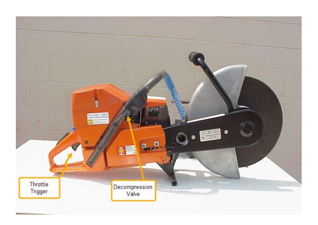
Ultra Kut II Saw Right Side View