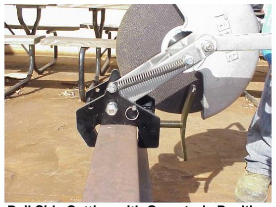
Rail Side Cutting with Operator's Position Adjacent to Clamp Tensioning Screw Stop Pin is inserted on operator's side.