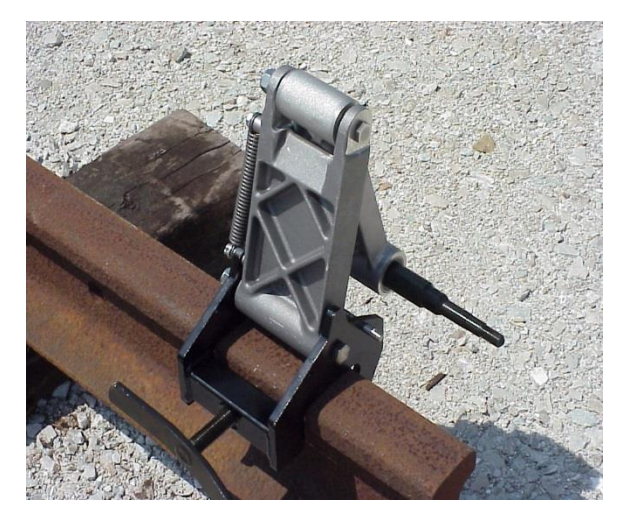
Rail Clamp Installed Rail clamp tensioning screw with T-Handle.