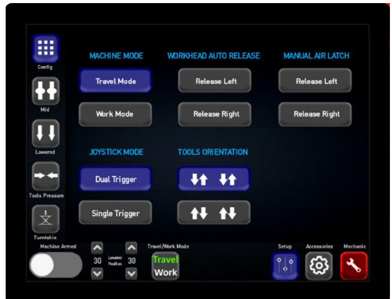
Operator Touchscreen Control Panel for Workhead Adjustment and Diagnostic Troubleshooting

For a complete list of specifications and machine options available, contact Racine Railroad Products, Inc. at: Tel (262) 637-9681 / email: custserv@racinerailroad.com 1955 Norwood Court Mount Pleasant, Wisconsin 53403