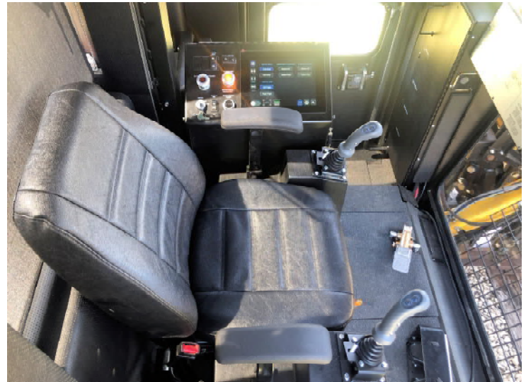
Operator Station with ergonomic seat & joystick controls.

Video of the Dual Clip Applicator: https://tinyurl.com/2s3nvxvp