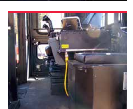
Optional seating available inside cab.