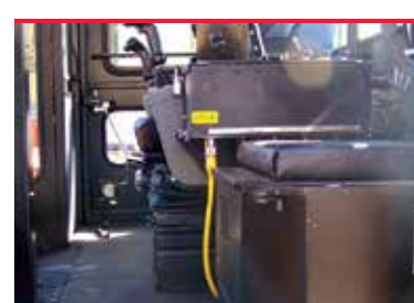
Optional seating available inside cab.

For a complete list of specifications and machine options available, contact Racine Railroad Products, Inc. at: Tel (262) 637-9681 • Fax (262) 637-9069 • email: custserv@racinerailroad.com 1955 Norwood Court • Mount Pleasant, Wisconsin 53403