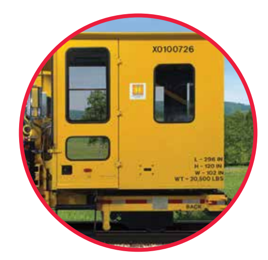
Extended cabs seat up to 5 additional passengers.