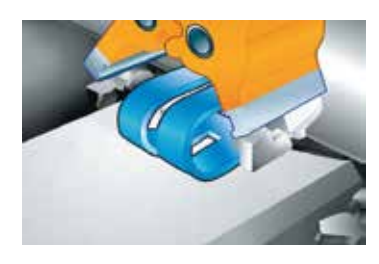
Retract tool is optically indexed over clip assembly.