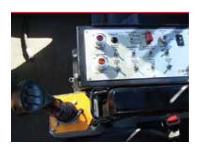
Electronic console with joy stick workhead controls.