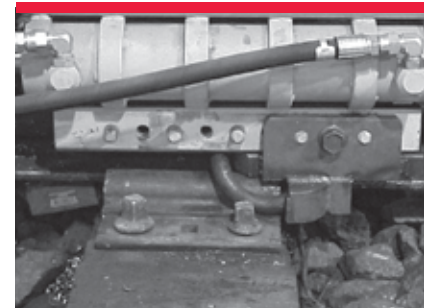
UC E-Clipper workhead