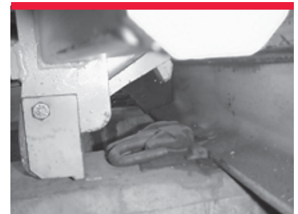
UC F-Clipper workhead