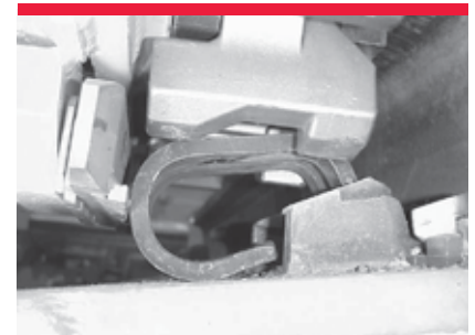
UC S-Clipper workhead

The Ultra Clipper's small size and just 850 lbs allows it to be loaded onto a maintenance cart or pick-up truck for transportation to the work site.